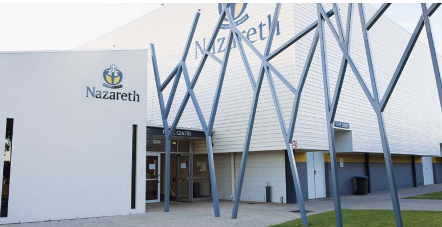
Nazareth College, Flinders Park.

In this workshop participants will be guided through some examples of using ICT tools to support STEM learning activities.