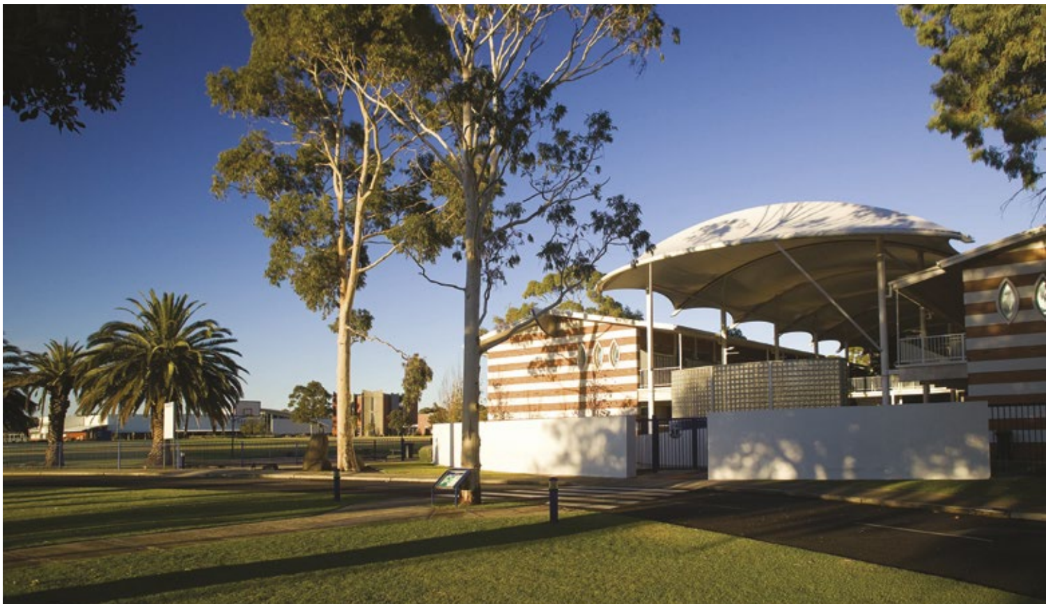
Immanuel College, Novar Gardens.

Ph 8354 0006 Email projectofficer@sasta.asn.au