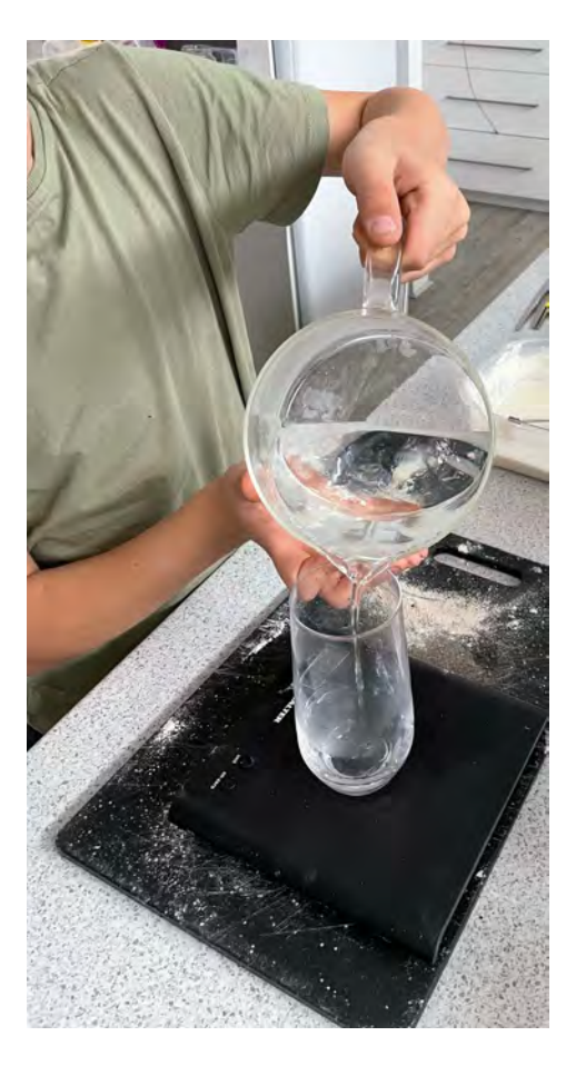
Measuring the warm water