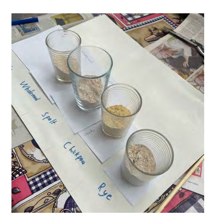
The 5 different types of flour weighed