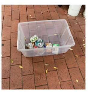
Our Ten Cents Bin