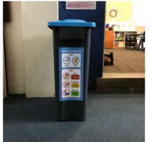
Our Indoor Paper Bin