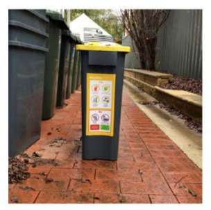
Our Indoor Recycling Bin