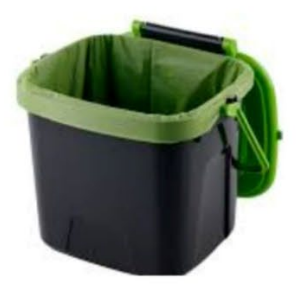
Our Indoor Compost Bin