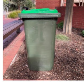
Our Outdoor Compost Bin