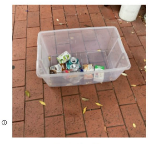
Our Outdoor Bin

What Goes In The Purple Bin At Highgate: