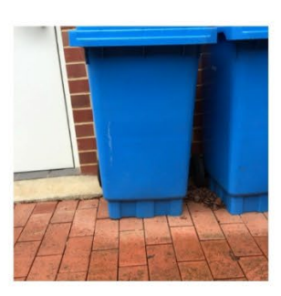
Our Outdoor Paper Bin